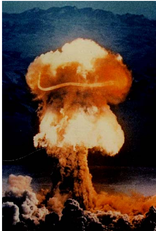
Ionized toroidal topological defect Pfaff topological dimension 3