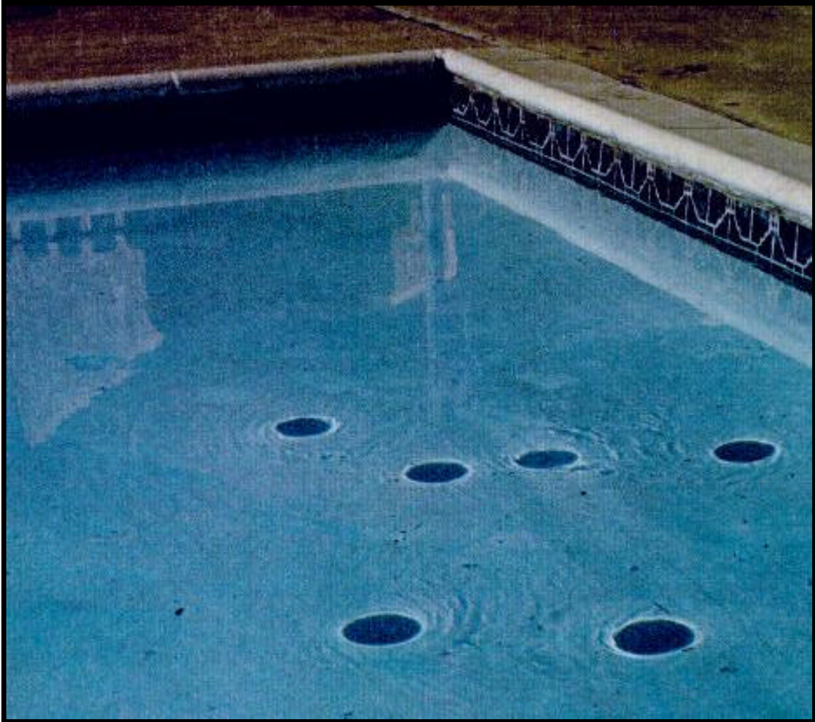
Photo 1. Three pairs of FALACO SOLITONS, a few minutes after creation. The kinetic energy and the angular momentum of a pair of Rankine vortices created in the free surface of water quickly decay into dimpled, locally unstable, singular surfaces that have an extraordinary lifetime of many minutes in a still pool. These singular surfaces are connected by means of a stabilizing invisible singular thread, or string, which if abruptly severed will cause the endcaps to disappear in a non-diffusive manner.